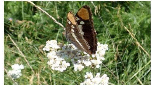
Yarrow makes a flat landing pad for this California Sister butterfly.

Flower shape affects which pollinators can access their pollen and nectar. For example, butterflies pollinate flowers with flat surfaces that are large enough for them to land on. Other pollinators, like hummingbirds, never land on flowers, but hover near them while they drink nectar instead. The flowers they feed on usually hang down and have long tube-like shapes. Flowers pollinated by beetles need to be sturdy and have an easy entrance, as beetles are clumsy in their flight.