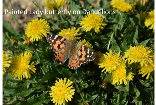
Painted Lady butterfly on Dandelions

Next discuss these questions with a family member: