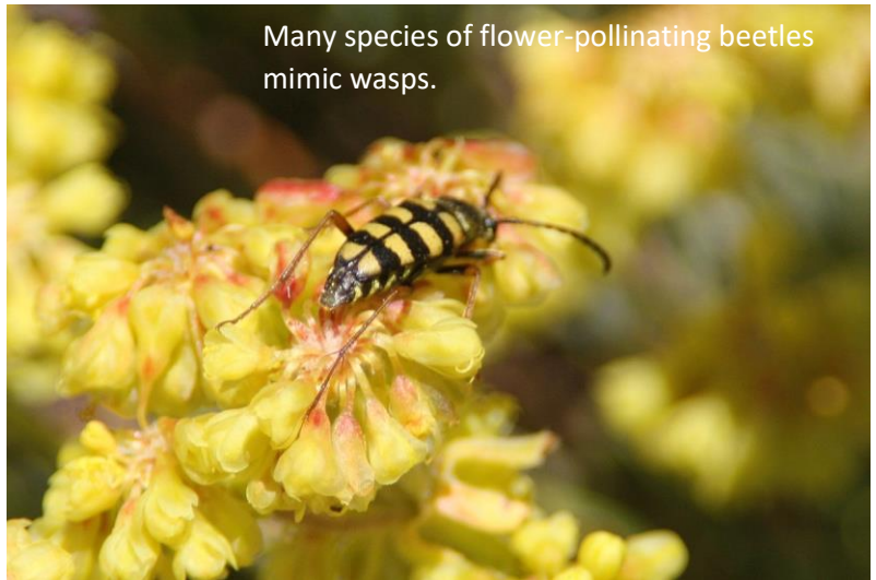
Many species of flower-pollinating beetles mimic wasps.

Pistil: The female part of a flower that moves pollen to the eggs to produce seeds.