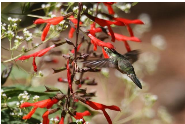
Many red flowers favored by hummingbirds are shaped to deposit pollen on the birds' heads.

Although fruit eating bats are important pollinators in other parts of the world, like Asia and Central America, the sixteen bat species that live in Tahoe are all insect eaters, and are not pollinators.