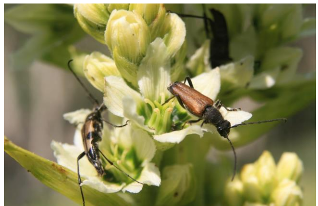
Two different Longhorned Beetles Visit a Corn Lily