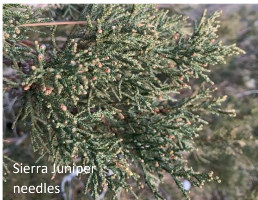
Sierra Juniper needles

Cedars are easier to tell apart from other conifers. Their needles look a bit like overlapping scales fanning out and they have strong smells. Their bark peels in long strands and their cones can sometimes look like berries. Cedars found in Tahoe are called the California Incense Cedar. This cedar looks similar to the Sierra Juniper tree, another conifer found in Tahoe. Sierra Juniper often look more like a shrub than tree, especially when compared with cedars. They have small bluish-gray cones that look like berries. One other conifer called Mountain Hemlock is found in Tahoe.