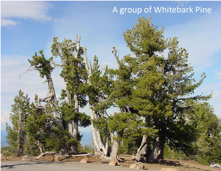
A group of Whitebark Pine

In Tahoe, we have three kinds of white pines, including Whitebark, Sugar, and Western White, all of which have bundles of five needles together. Whitebark Pine trees are often seen in tight groups, with several trees growing out of the same spot. This happens because of a symbiotic relationship that these trees have with a local bird, the Clark's Nutcracker. These birds like to eat the seeds of Whitebark Pine and the trees rely on the bird to spread their difficult to reach seeds. As Clark's Nutcrackers get ready for winter, they bury the seeds in the ground to eat later. If the bird forgets one of its buried piles of seeds, or doesn't end up needing those seeds, the seeds grow into trees.