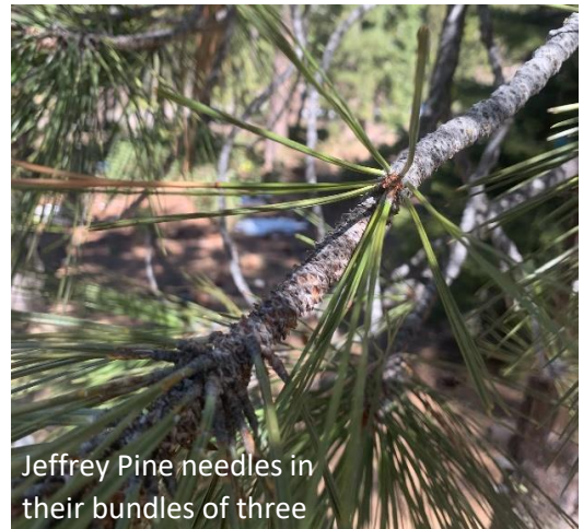
Jeffrey Pine needles in their bundles of three

Fir needles are flat and friendly, and they often have two white stripes on the underside of each needle. Firs that are found in Tahoe include White Fir and Red Fir. Spruce needles have spikey points, are easy to roll in your fingers, and are stiff, square, and often short. Spruce trees are not naturally found in Tahoe, but you might find some that people have planted in their yards. Other ways to figure out if a conifer is a spruce, pine, or fir is by looking at their cones, their bark, or their habitat.