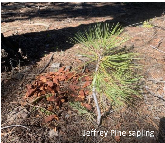
Jeffrey Pine sapling

Luckily, there are people in Tahoe who work hard to take care of trees that are being hurt by disease and other problems. Scientists have figured out how to take seeds from pine trees that don't get blister rust and use those seeds to grow trees that will be resistant to disease.