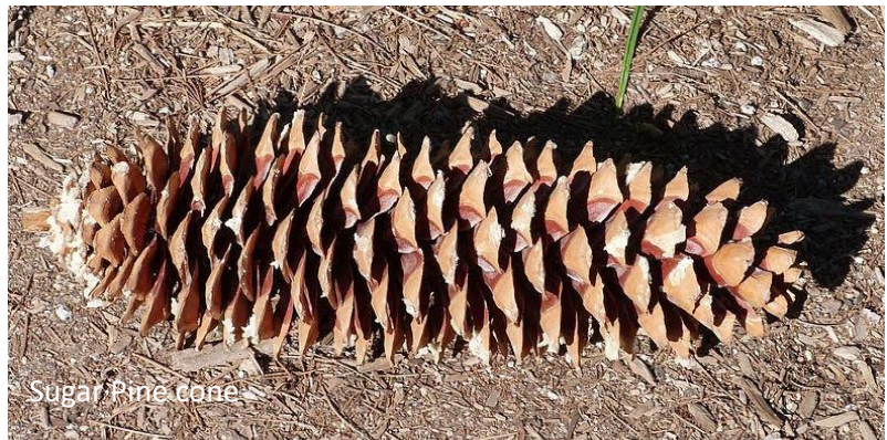
Sugar Pine cone